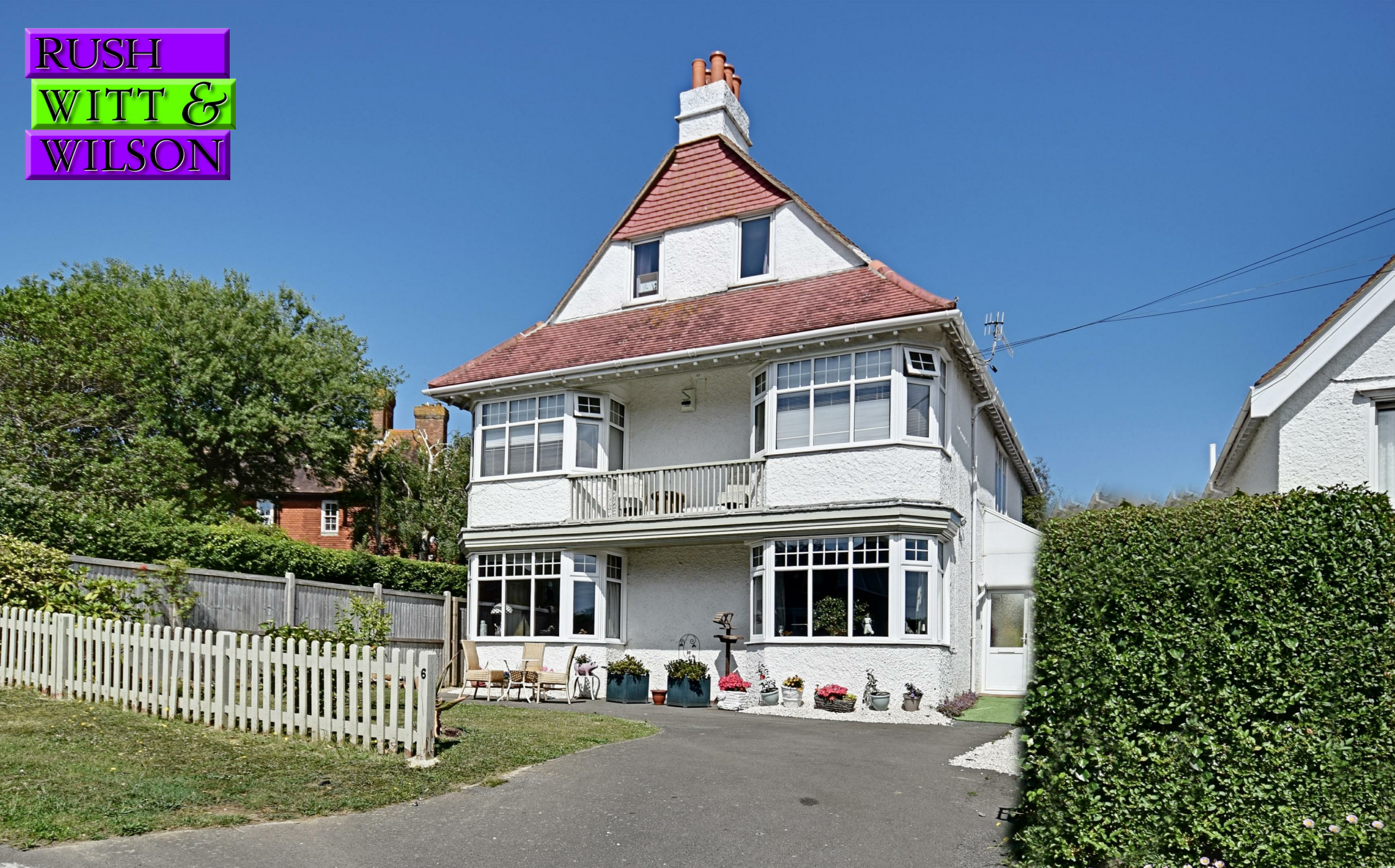
6 Penland Road, Bexhill-On-Sea, East Sussex TN40 2JG £685,000