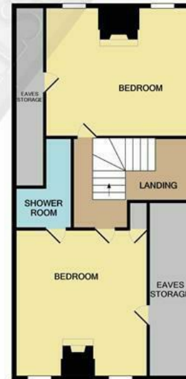
2ND FLOOR APPROX. FLOOR AREA 656 SQ.FT. (60.9 SQ.M.)

TOTAL APPROX. FLOOR AREA 3054 SQ.FT. (283.7 SQ.M.)