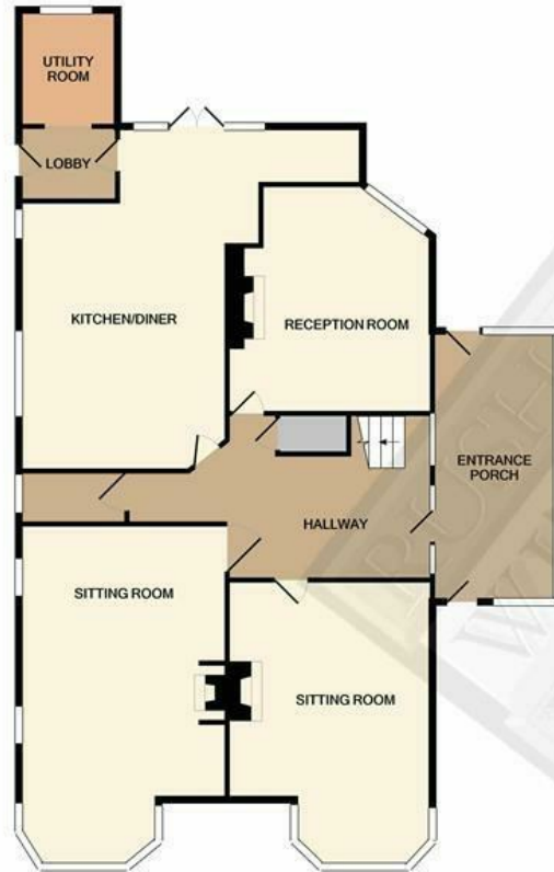
GROUND FLOOR APPROX. FLOOR AREA 1330 SQ.FT. (123.6 SQ.M.)