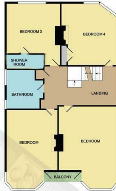
1ST FLOOR APPROX. FLOOR AREA 1068 SQ.FT. (99.2 SQ.M.)